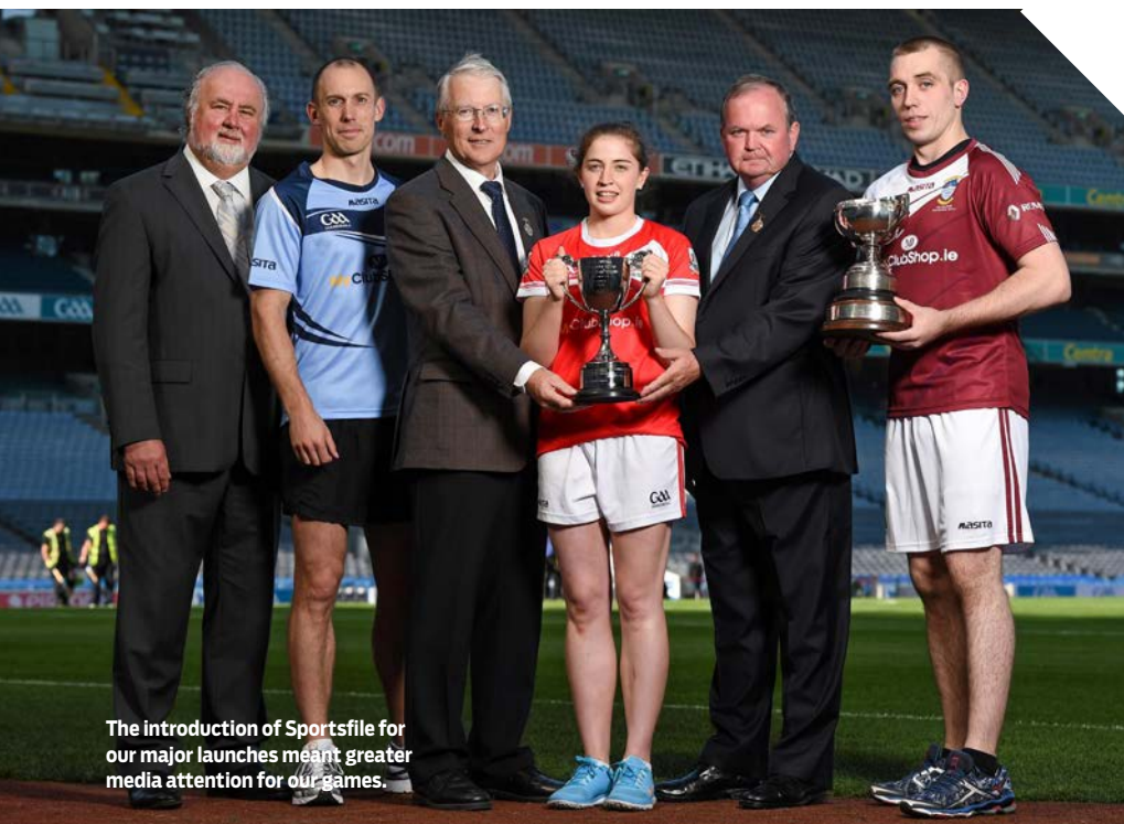
The introduction of Sportsfile for our major launches meant greater media attention for our games.

respective provinces. I also extend thanks to the provincial boards and to all our county committees and club committees who administer our sport.