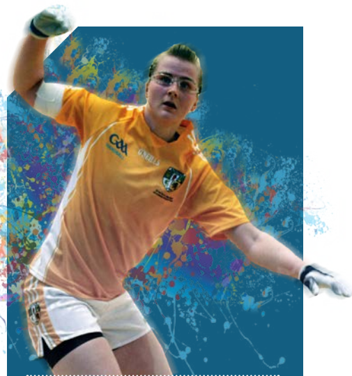
Liam de Róiste Uachtarán