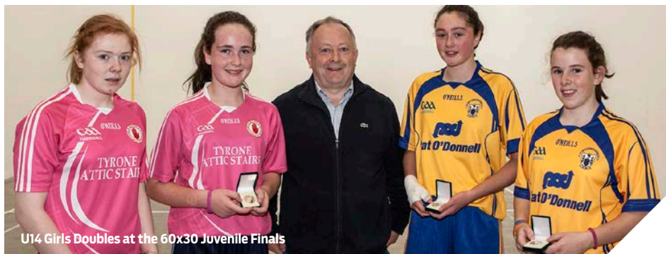
U14 Girls Doubles at the 60x30 Juvenile Finals

the National Office and the ICHA. Over the next number of years I hope to see the continued growth of the ICHA and congratulate the committee on their sterling work once again this year.