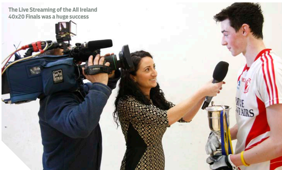
The Live Streaming of the All Ireland 40x20 Finals was a huge success

throughout the country and creating awareness about our game and I feel we need to make a major push to bring the One Wall game outdoor to public parks and recreational areas to maximise it's potential. Having the GAA Handball brand visible throughout the country would in no doubt raise the profile of the game.