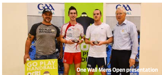
One Wall Mens Open presentation