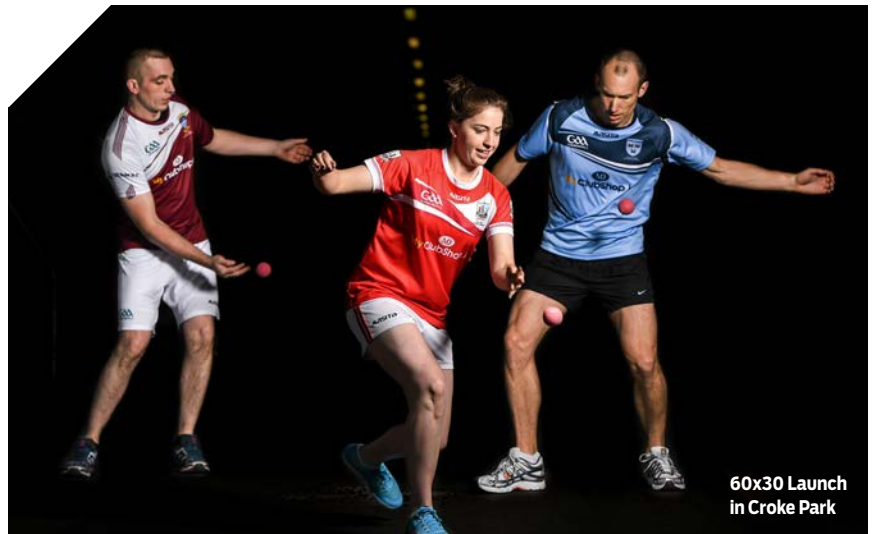
60x30 Launch in Croke Park

The 60x30 game is a fantastic spectacle to watch and we need to ensure that the All Ireland finals are standalone fixtures in order to generate bigger crowds and create more interest in the game. Having other finals on at the same time only dilutes the potential audience for what should be our Blue Riband event of the 60x30 season.